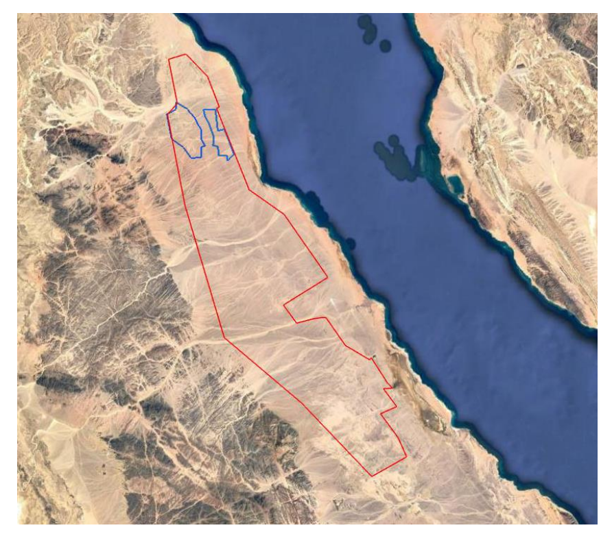
Figure 1: Project Site (Red) as Part of the National-Decree Area Allocated for Wind Farm Developments (Consultant, 2019)